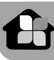
EXHIBIT SPACE APPLICATION / CONTRACT