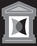
EXHIBIT SPACE APPLICATION / CONTRACT